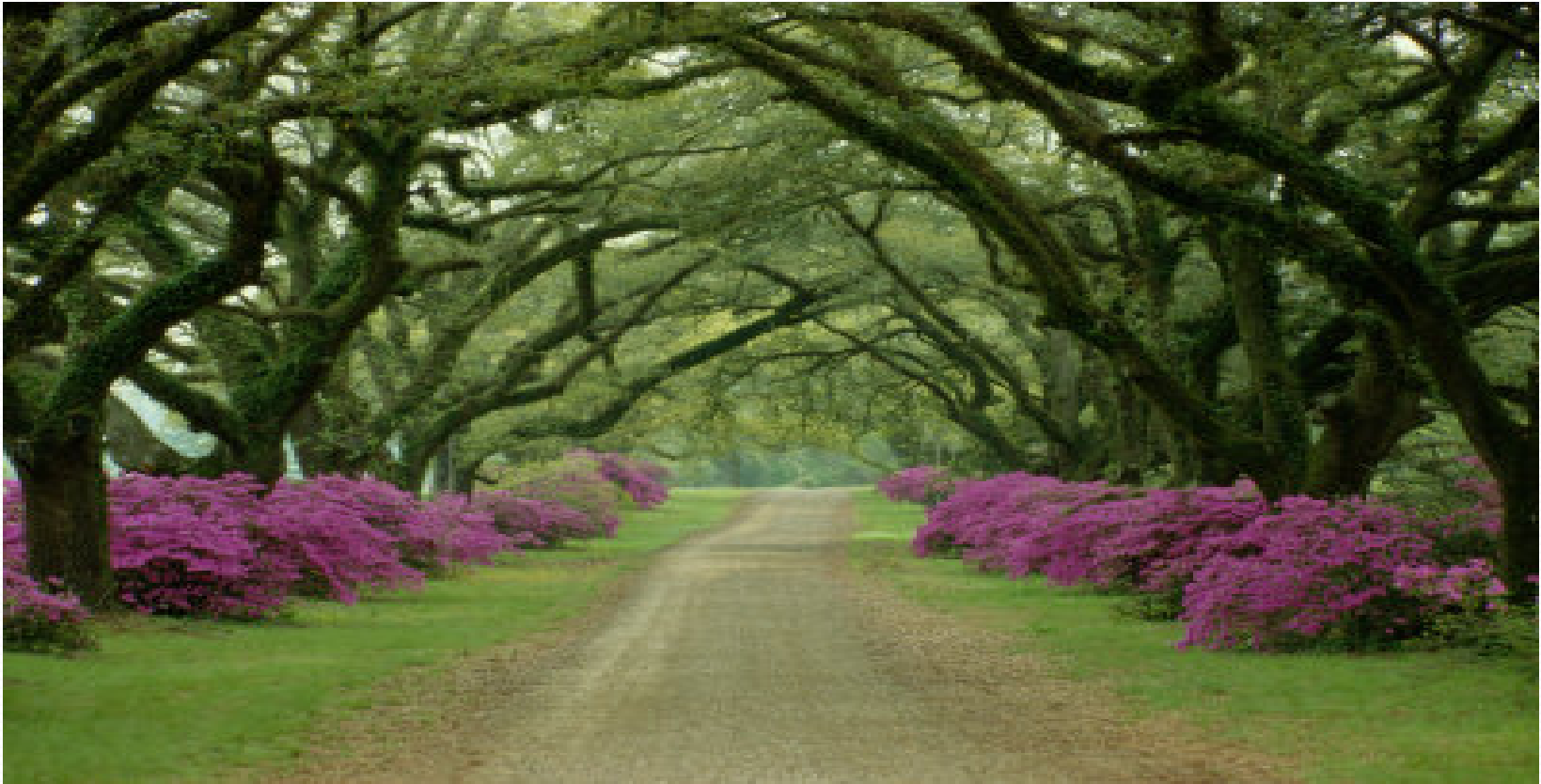
A Beautiful Pathway Lined With Trees And Purple Azaleas