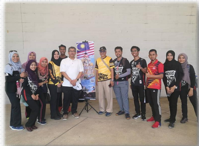
Buddies Day Out by DENSA