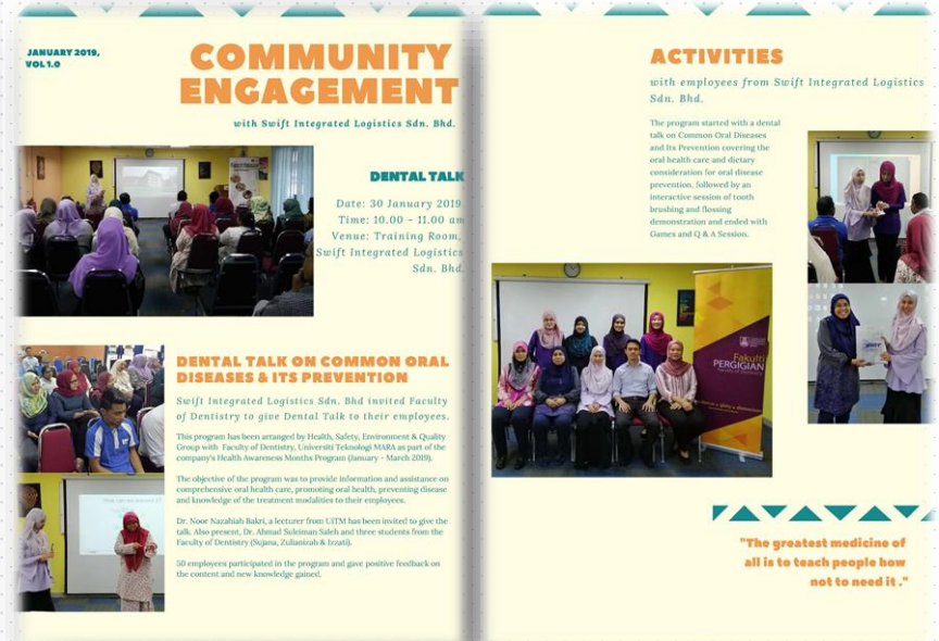
Community Engagement with Swift Integrated Logistics Sdn. Bhd.