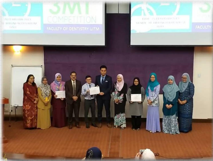
1 st – 3 rd Place in 3MT Competition (Faculty Level)