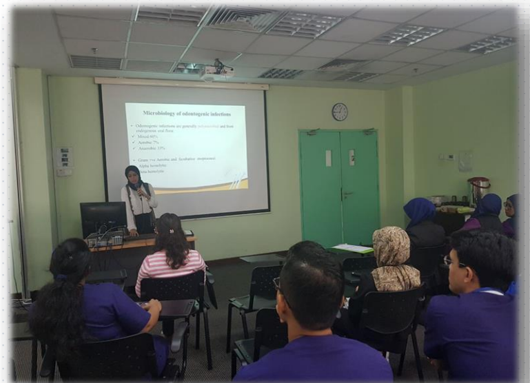
Clinical Resident Case Presentation