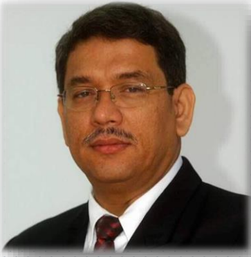
Dean's Reappointment from 1 January 2019