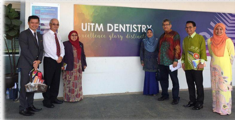
Different Ability Health Conference 2.0