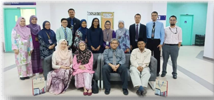
FRGS Workshop & Evaluation