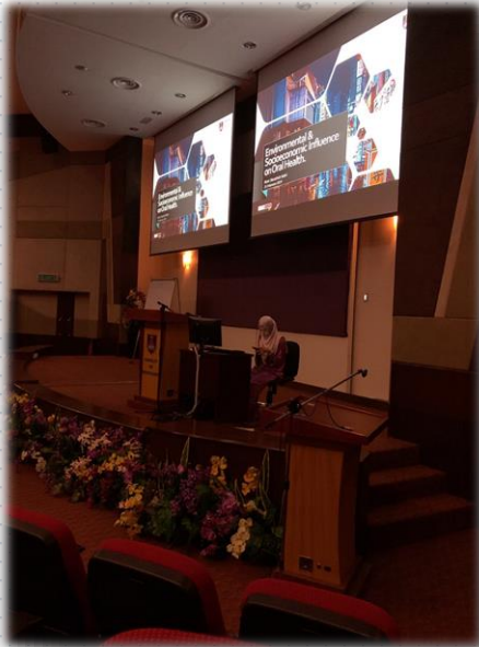
CDC by Population Oral Health & Clinical Prevention