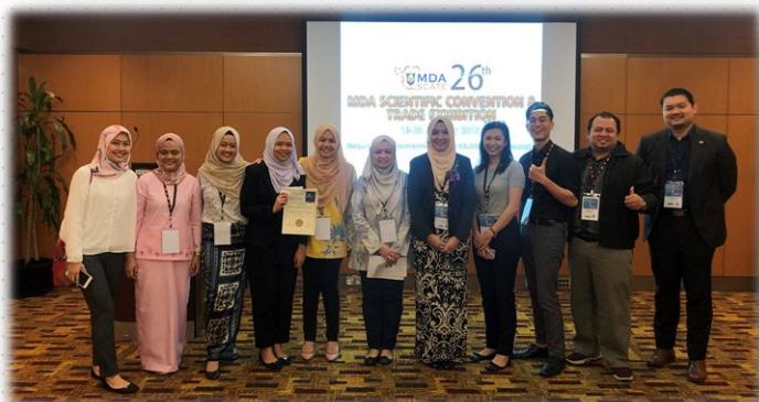
Student Participation at MDA Scientific Convention & Trade Exhibition