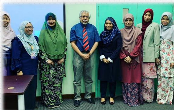
The Art of Publishing Research Manuscript Seminar

Amplification-free and direct fluorometric determination of telomerase activity in cell lysates using chimeric DNA-templated silver nanoclusters